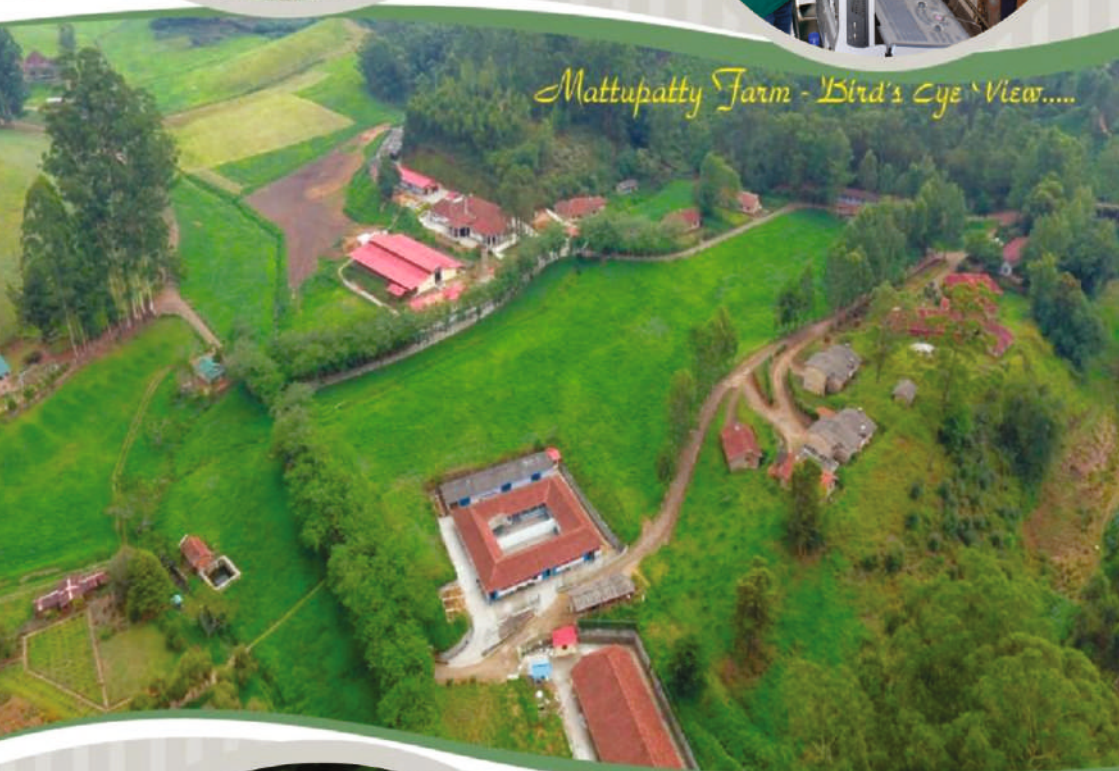
Mattupatty Farm - Bird's Eye View.....