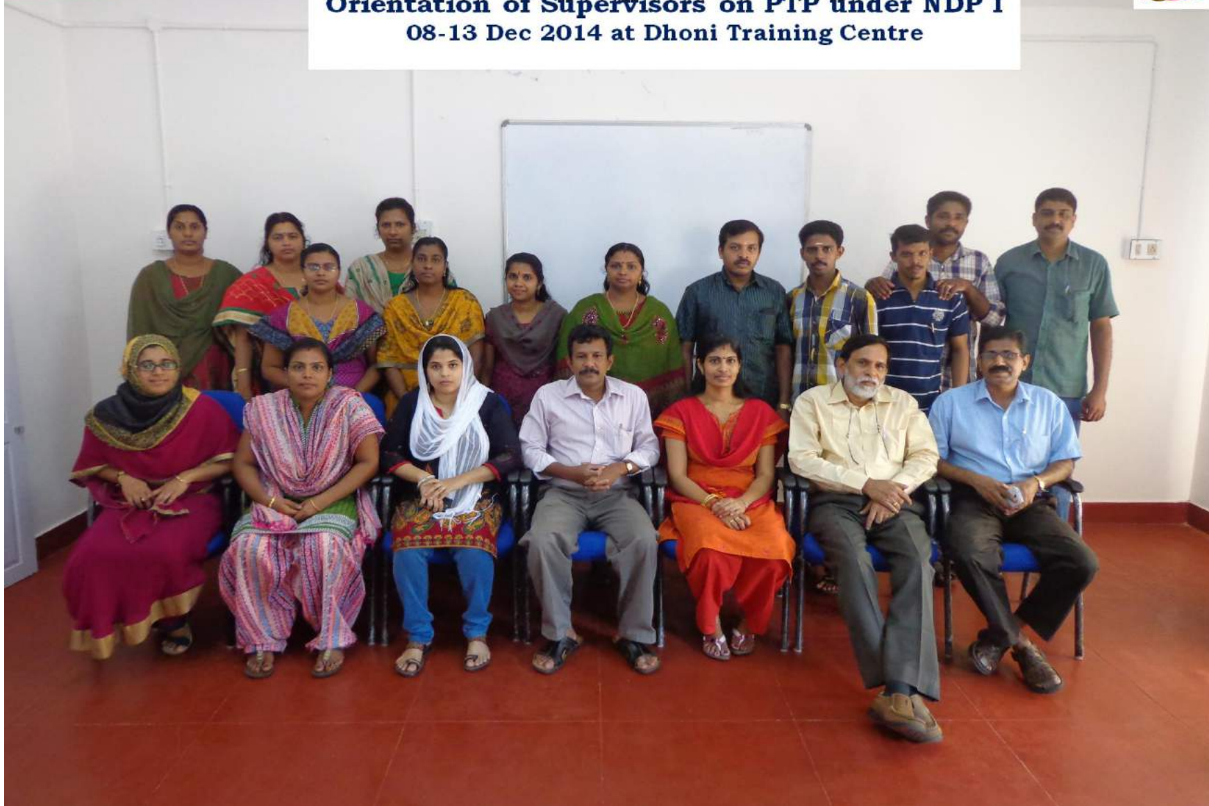
Orientation of Supervisors on PTP under NDP I

Orientation of Supervisors on PTP under NDP I 08-13 Dec 2014 at Dhoni Training Centre