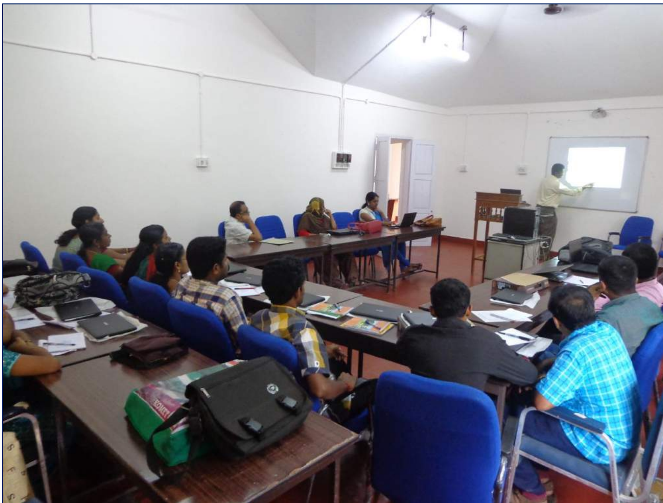
Orientation of Supervisors on PTP under NDP I