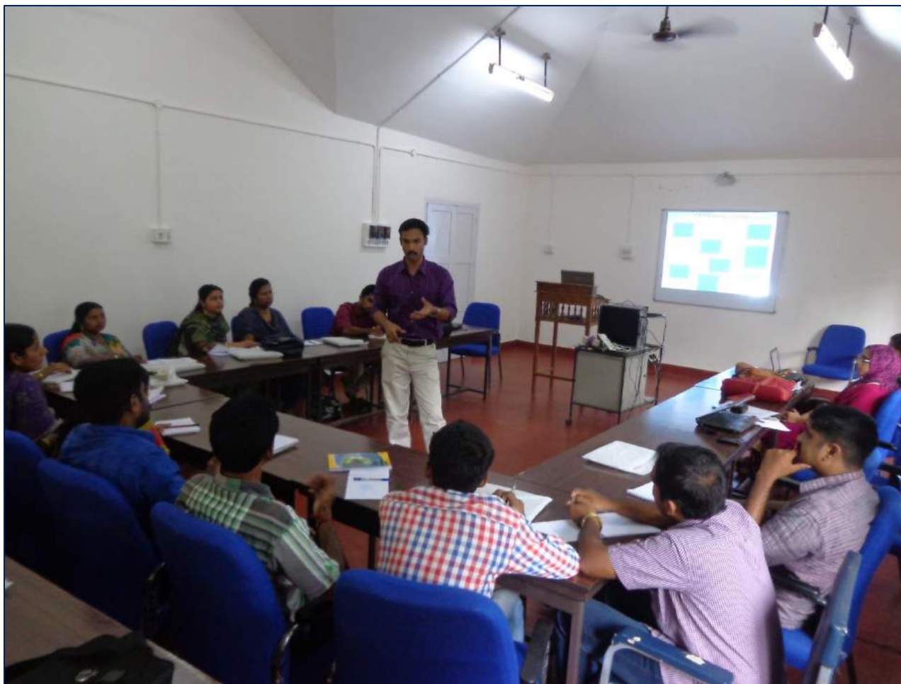
Orientation of Supervisors on PTP under NDP I