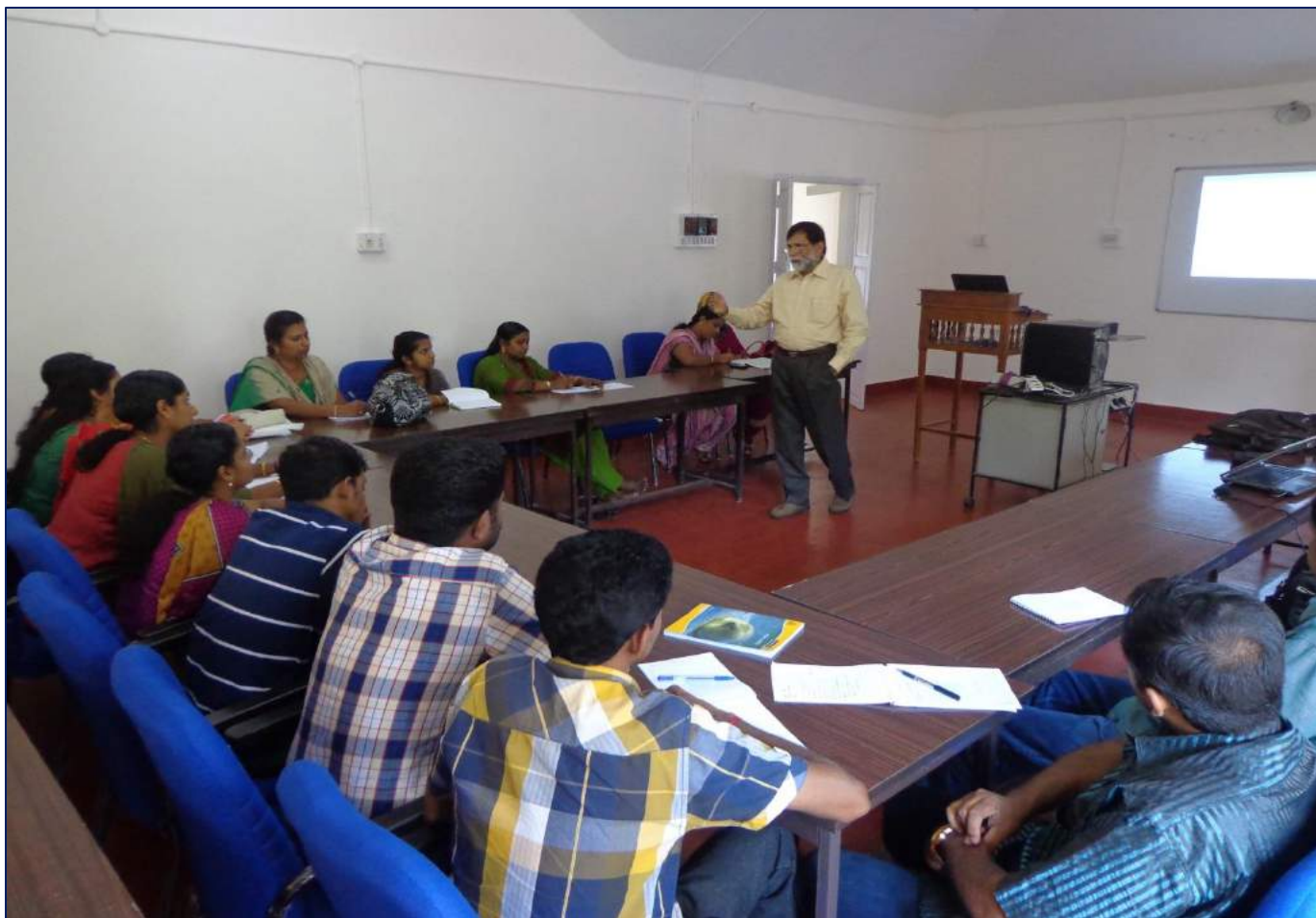
Orientation of Supervisors on PTP under NDP I