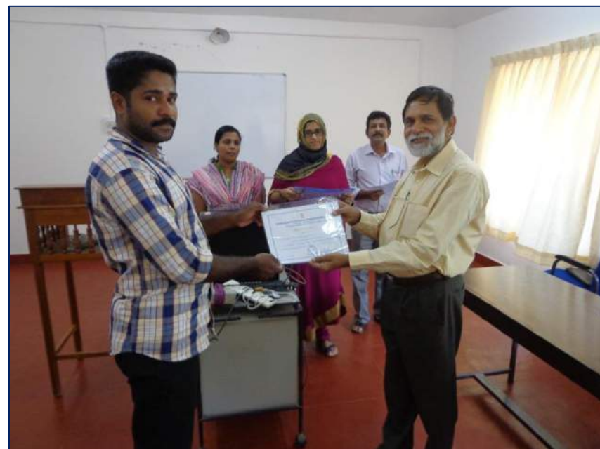
Orientation of Supervisors on PTP under NDP I